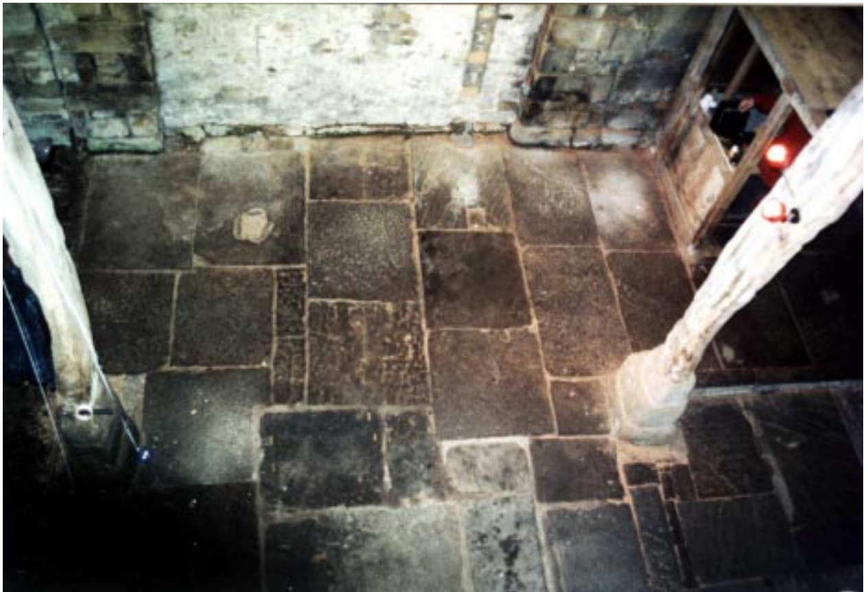
16. Later threshing floor