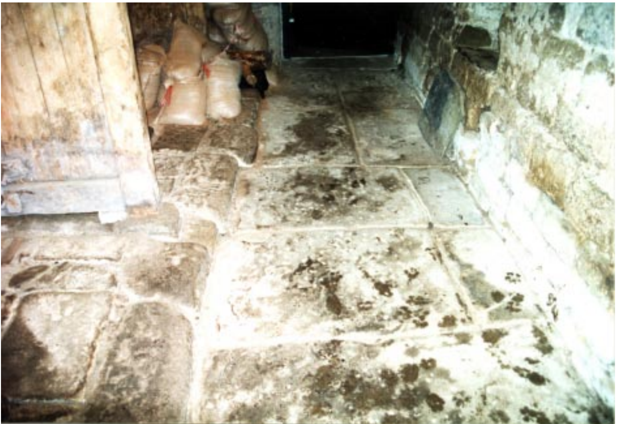
18. Feeding walk behind the southern range of stalls