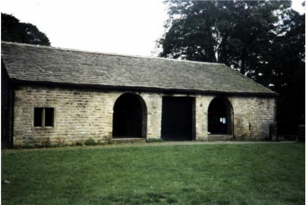
1. Symmetrical west facade created in the 18th century