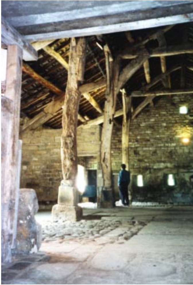
15. Cow stalls may once have occupied the west aisle