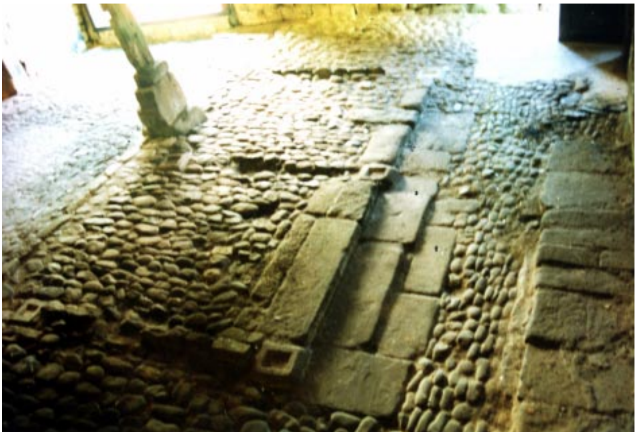
14. Cobbled feeding walk behind cow stalls