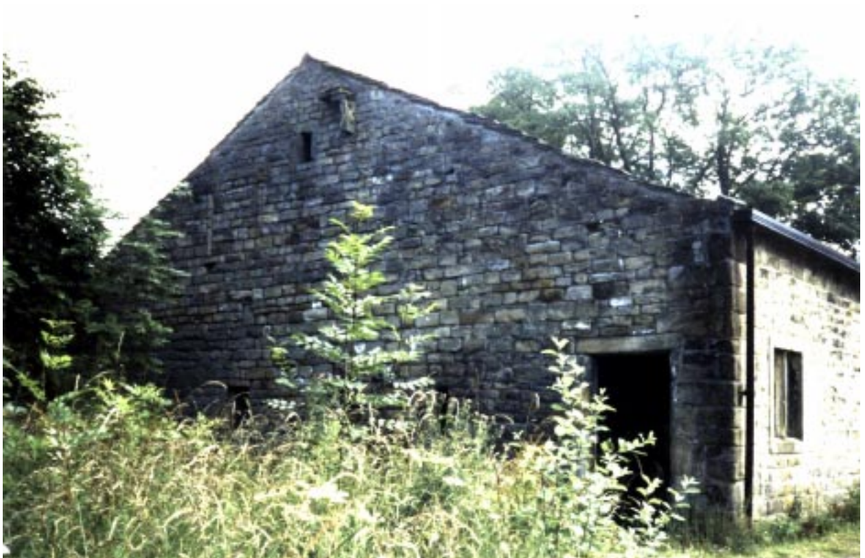
4. North gable, with former door to loft