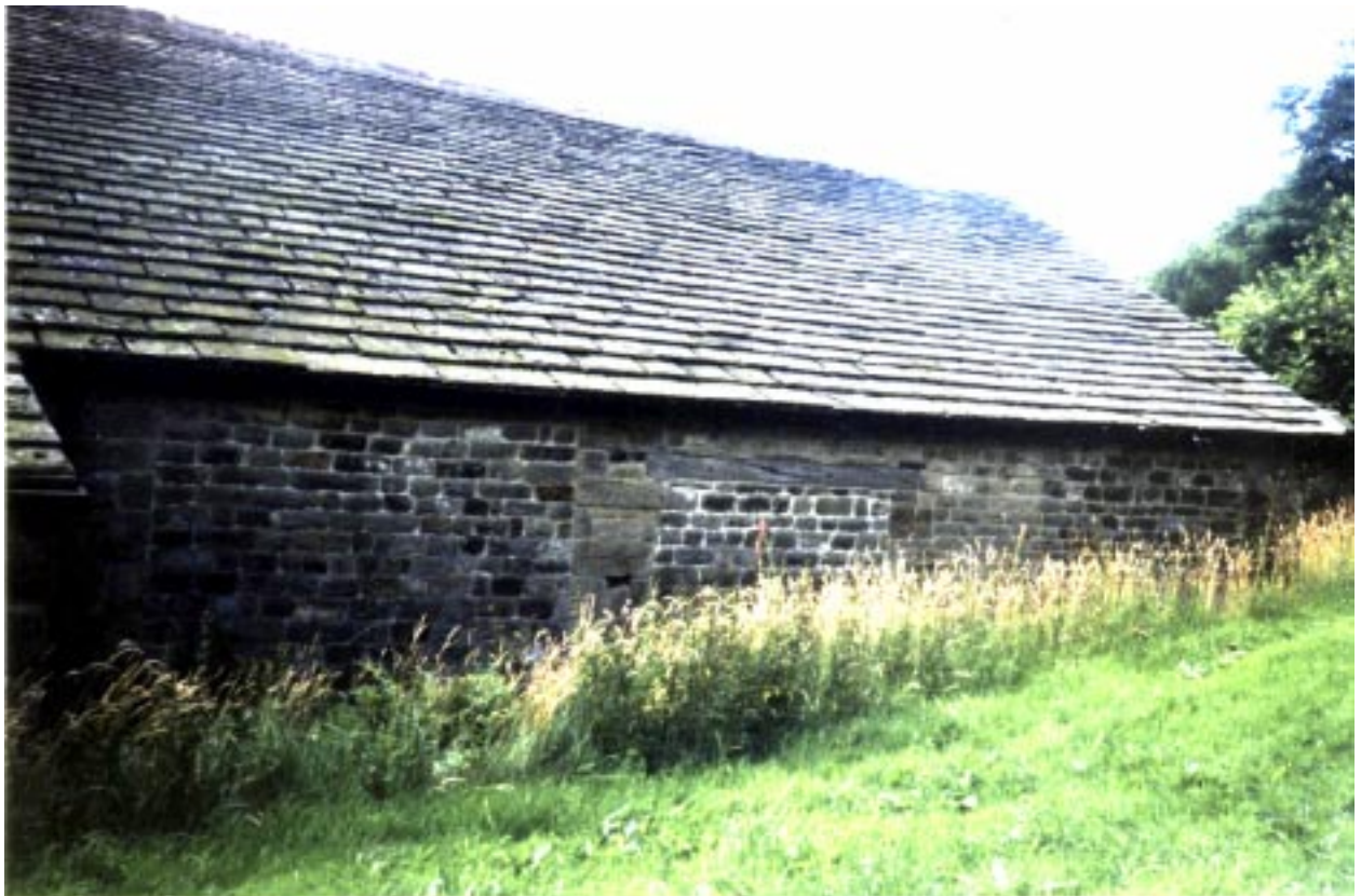
2. Barn and outshot from the East