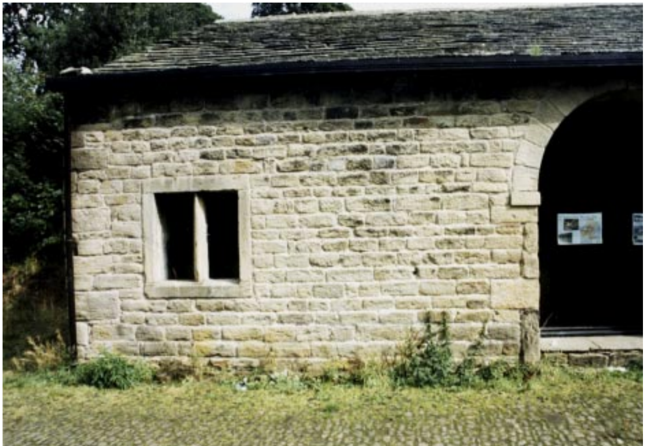
8. One of a pair of 18th-century windows; the south one is now blocked.