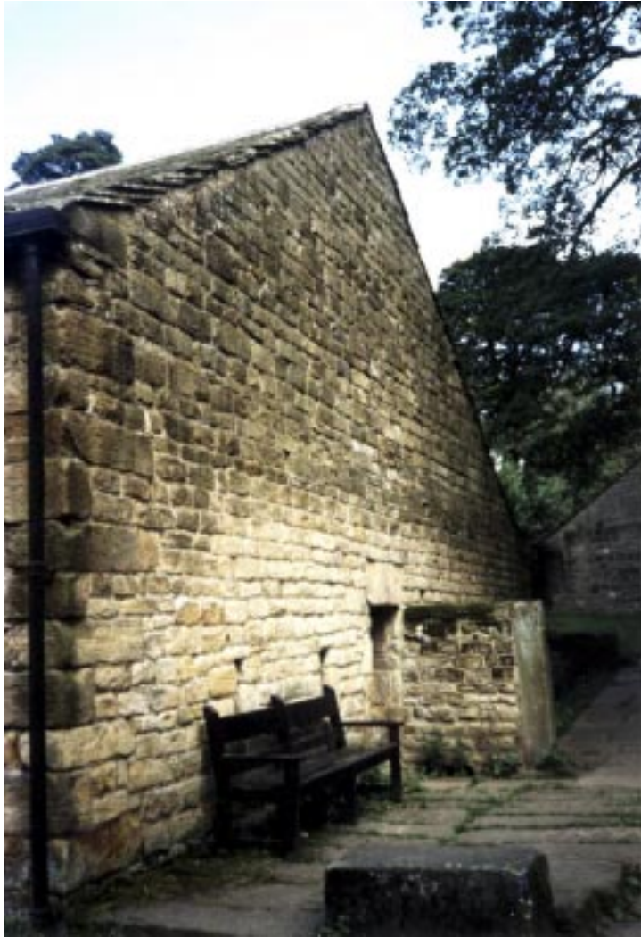
3. South gable with central door opening outwards