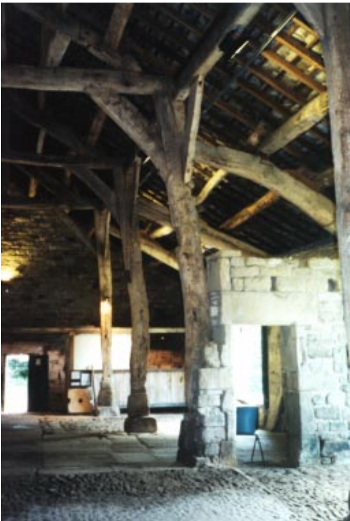
12. In Type III aisled barns, a sloped tiebeam supports the aisle roof