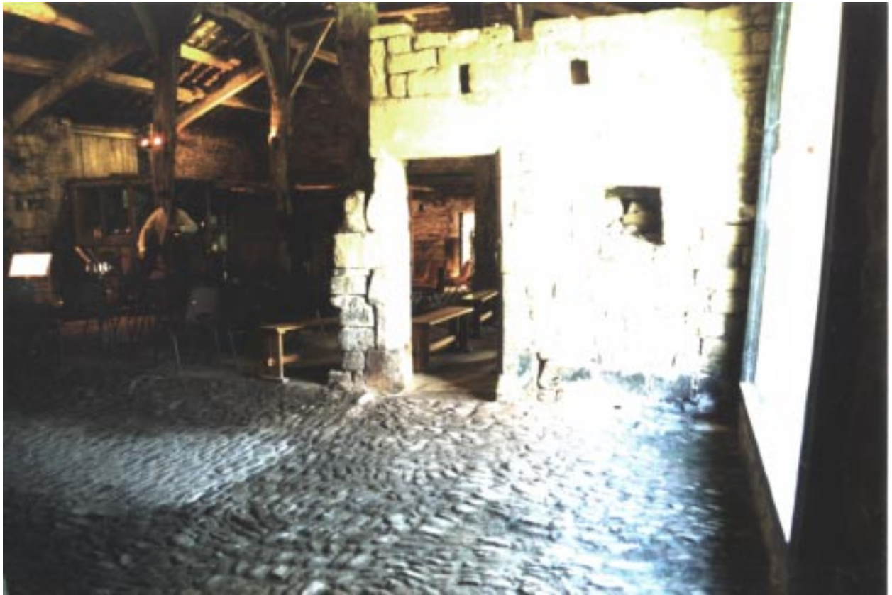
13. Possible doorway to original cattle stalls, with lamp recess to the right