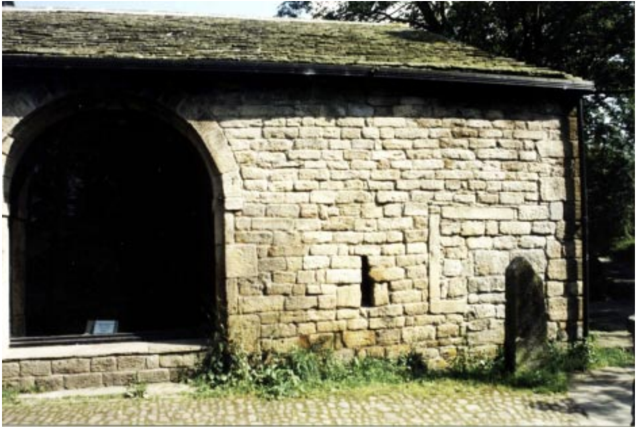
5. 18th-century window replaced by later door to feeding passage, also blocked