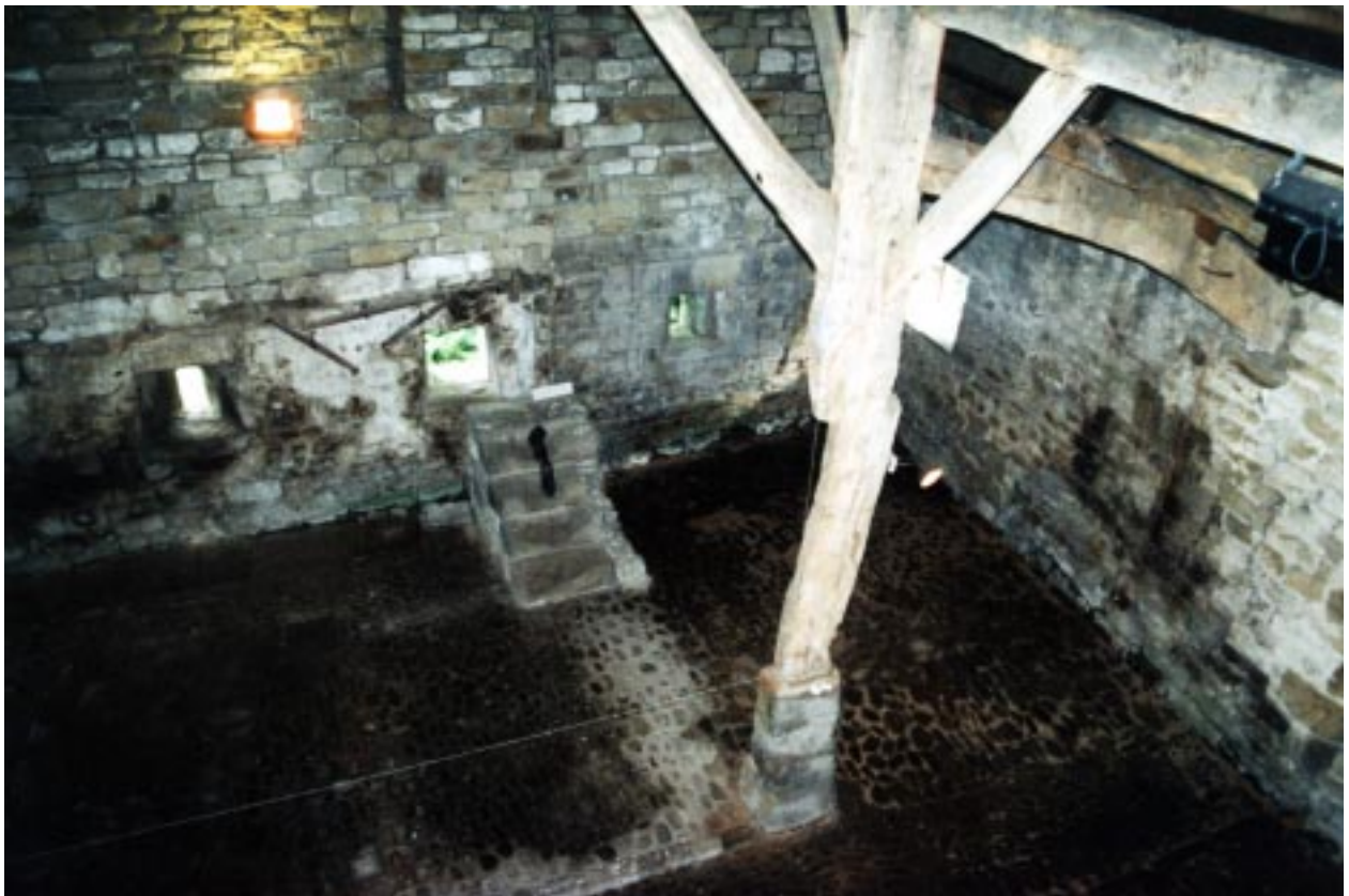
10. Post possibly re-used from a tiebeam