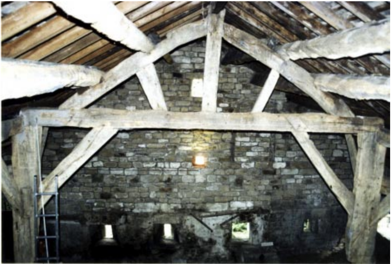
11. Post-medieval trusses have struts flanking the king post.