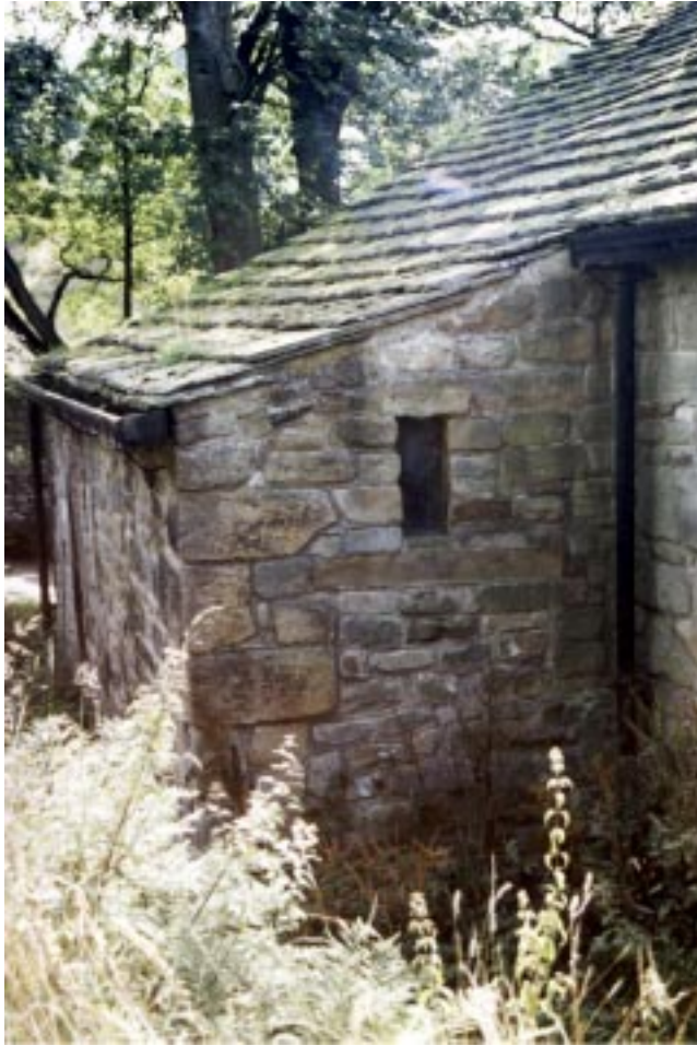
9. Blocked door and new window to outshot- alteration of c.1980