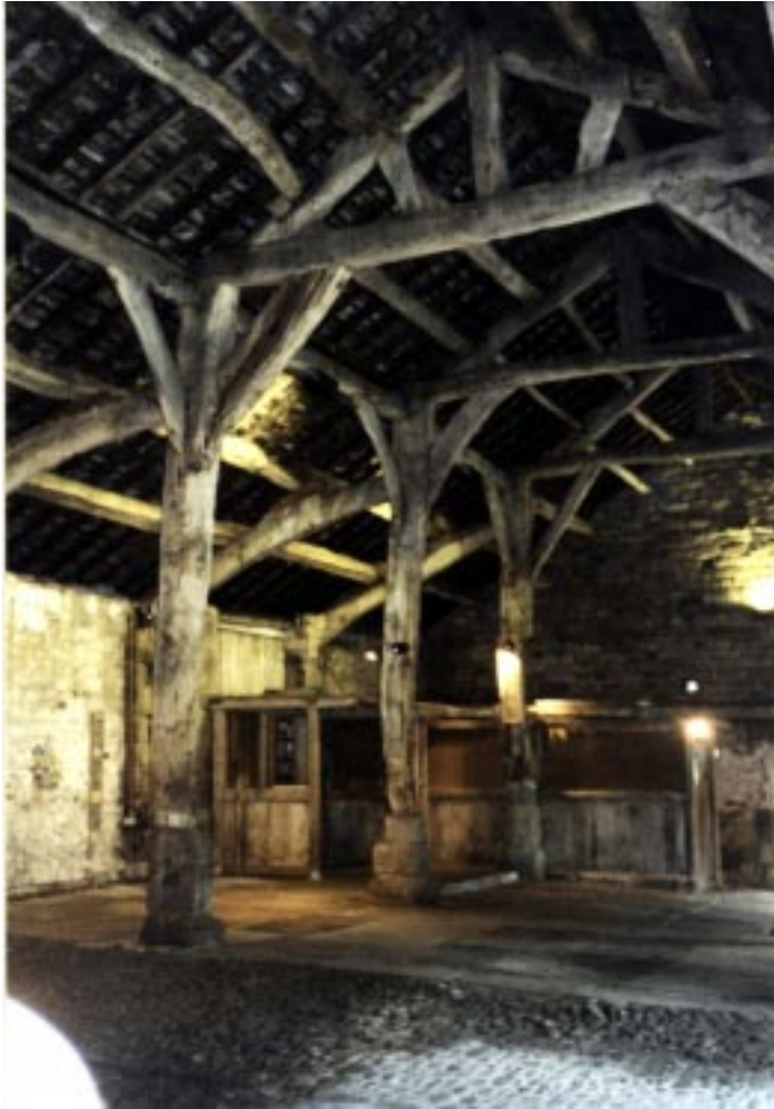
17. Stalls for cattle survive in the southern bay