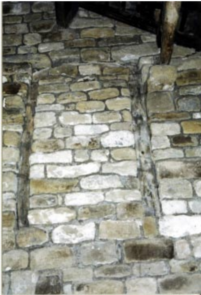
7. Door to former loft over the northern bay