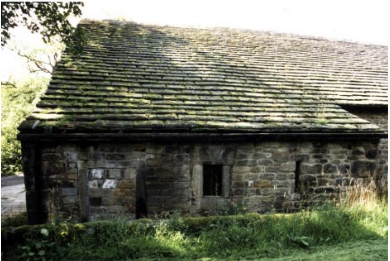
6. Blocked door in outshot probably gave access to feeding passage for cattle